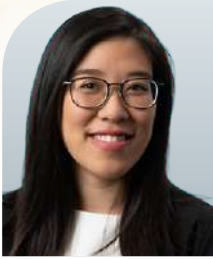
LO TSZ SHAN CLYDE & CO.