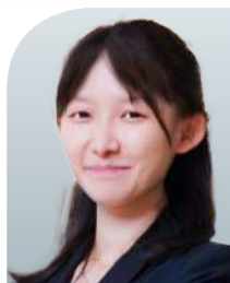
LUI ON NI THE UNIVERSITY OF HONG KONG