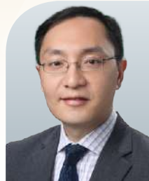
CHEUNG WAI CHUNG HUMPHREY HUMPHREY & ASSOCIATES