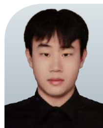
YANG TAO CITY UNIVERSITY OF HONG KONG