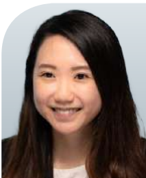
LO WAI CLYDE & CO.