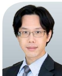
SZE VINCENT WING YIN SKADDEN, ARPS, SLATE, MEAGHER & FLOM