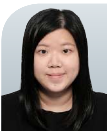
CHONG KIT WAI DALY & ASSOCIATES

It is our duty to assist those who are poor, vulnerable or marginalized to obtain legal protection - offering pro bono assistance to them is key to the rule of law in Hong Kong.