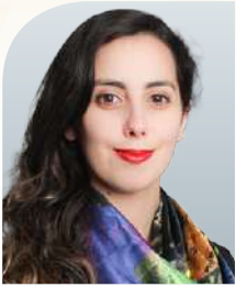
ARENA JACQUELINE SKADDEN, ARPS, SLATE, MEAGHER & FLOM