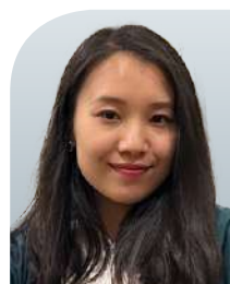
MAN LOK YIU ALANIS MORISSETTE THE UNIVERSITY OF HONG KONG