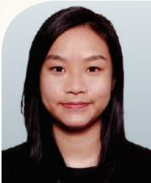
CHOK NOK YIU DALY & ASSOCIATES

It is our duty to assist those who are poor, vulnerable or marginalized to obtain legal protection - offering pro bono assistance to them is key to the rule of law in Hong Kong.