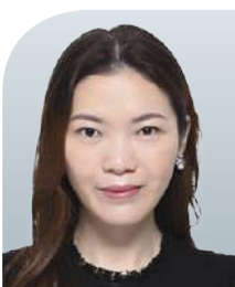
LAI SHUK YEE CITY UNIVERSITY OF HONG KONG