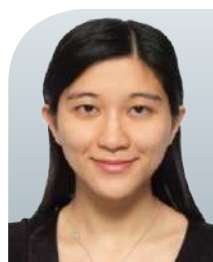
TSE WINNIE SINOPEC CENTURY BRIGHT CAPITAL INVESTMENT LIMITED