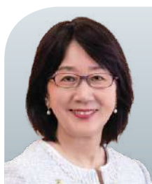
Ada CHUNG Lai-ling 鍾麗玲女士

Privacy Commissioner for Personal Data Office of Privacy Commissioner for Personal Data