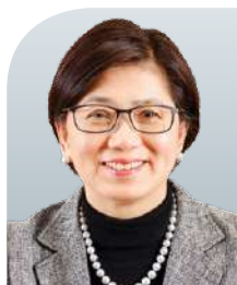
Winnie CHIU Wai-yin, PDSM, PMSM 趙慧賢女士, PDSM, PMSM

The Ombudsman Office of Ombudsman, Hong Kong