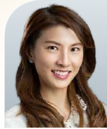
PE PRAIRIE YANG MAYER BROWN