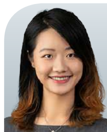
CHEN BIXIN MORRISON & FOERSTER