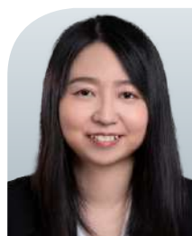
CHENG LAI LI & PARTNERS