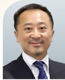
KONG PING TO KONG BENNY & TSAI LLP