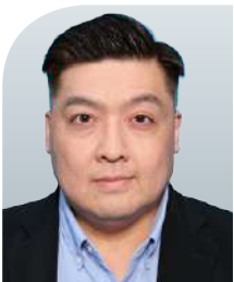
LAM TSZ CHUNG LAU & CO., C.W.