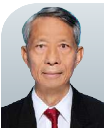
NG KIN WAH NG & CO., KEVIN SOLICITORS