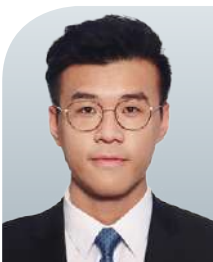
YEUNG SHUN MAN LEUNG & CO., H.Y. LLP

I enjoy helping people in need and learning from them, in different walks of life. I also enjoy taking up management and interpersonal skills outside my legal knowledge. It was also fun and meaningful.