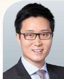
XIU XUNZE MORRISON & FOERSTER