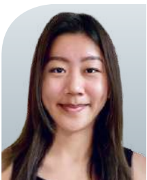
HUI HING YI LINKLATERS