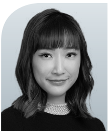
LAU KA MAN WHITE & CASE