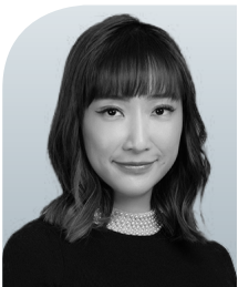
LAU KA MAN WHITE & CASE