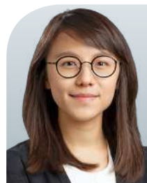
MAK NOBLE HONG SZE DAVIS POLK & WARDWELL